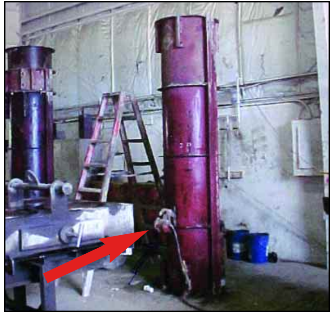
Model SVRLS-5500 on pipe form.

High slump concrete using SVRWS-4000 (page 3). High frequency pneumatic vibration was used. VWF-female brackets were welded to form - 2 per form - one low and one high - opposite sides.