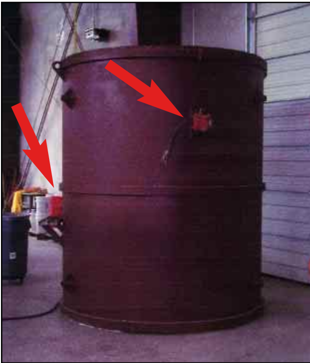
Model SVRLS-6500 on pipe form.